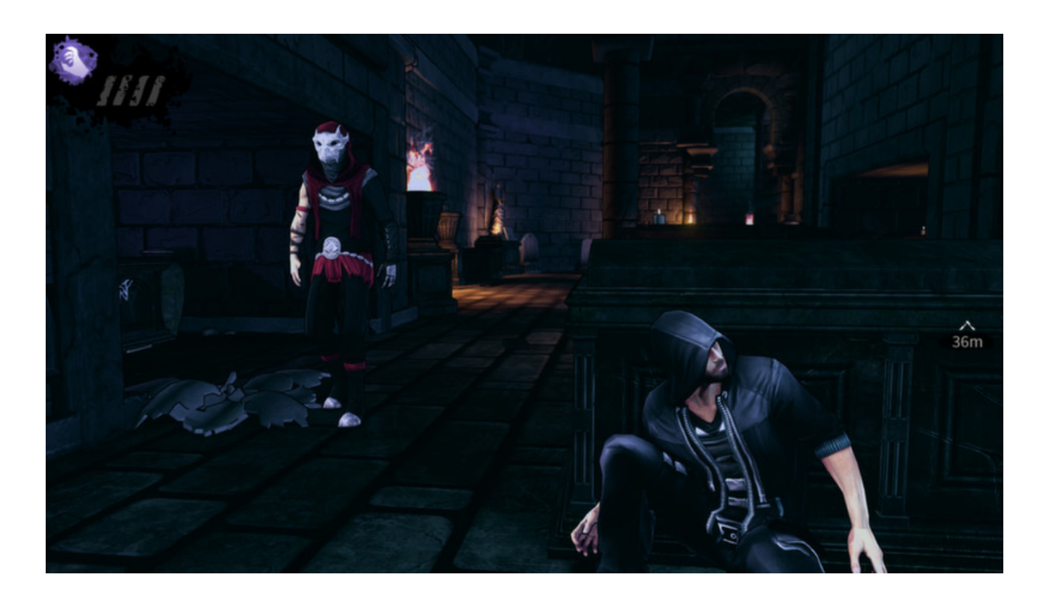
DARK - Cult Of The Dead DLC Download Complete Edition

Download >>> <a href="http://bit.ly/2Jnmd9g">http://bit.ly/2Jnmd9g</a>